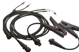
+ KC1 Kelvin clip 3 m leads